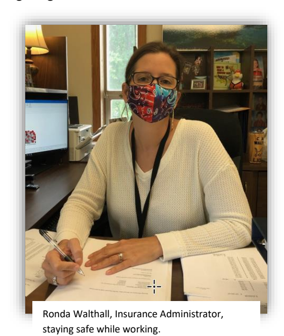
Page | 2